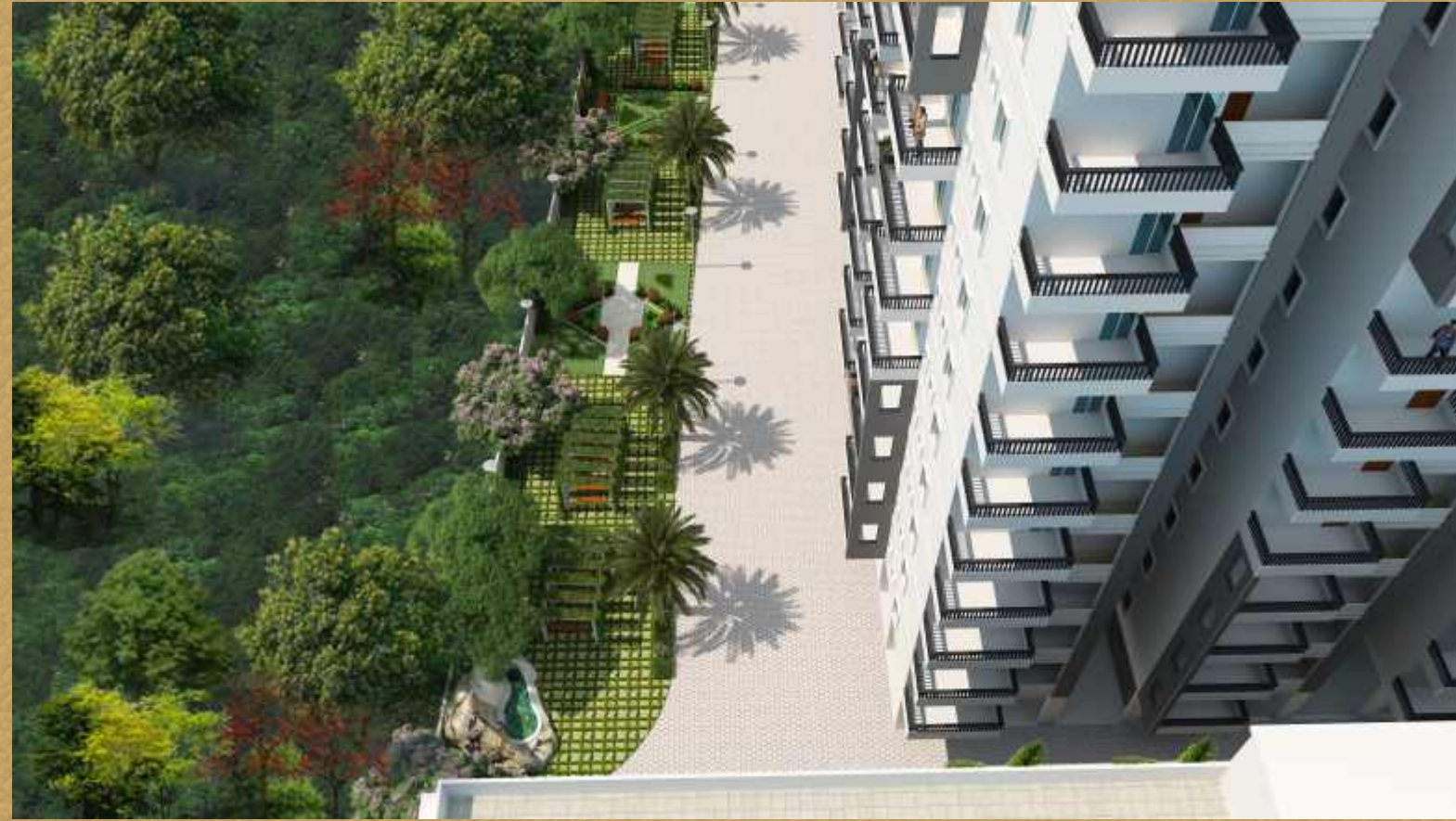
A full fledged landscape entertain you perfectly.