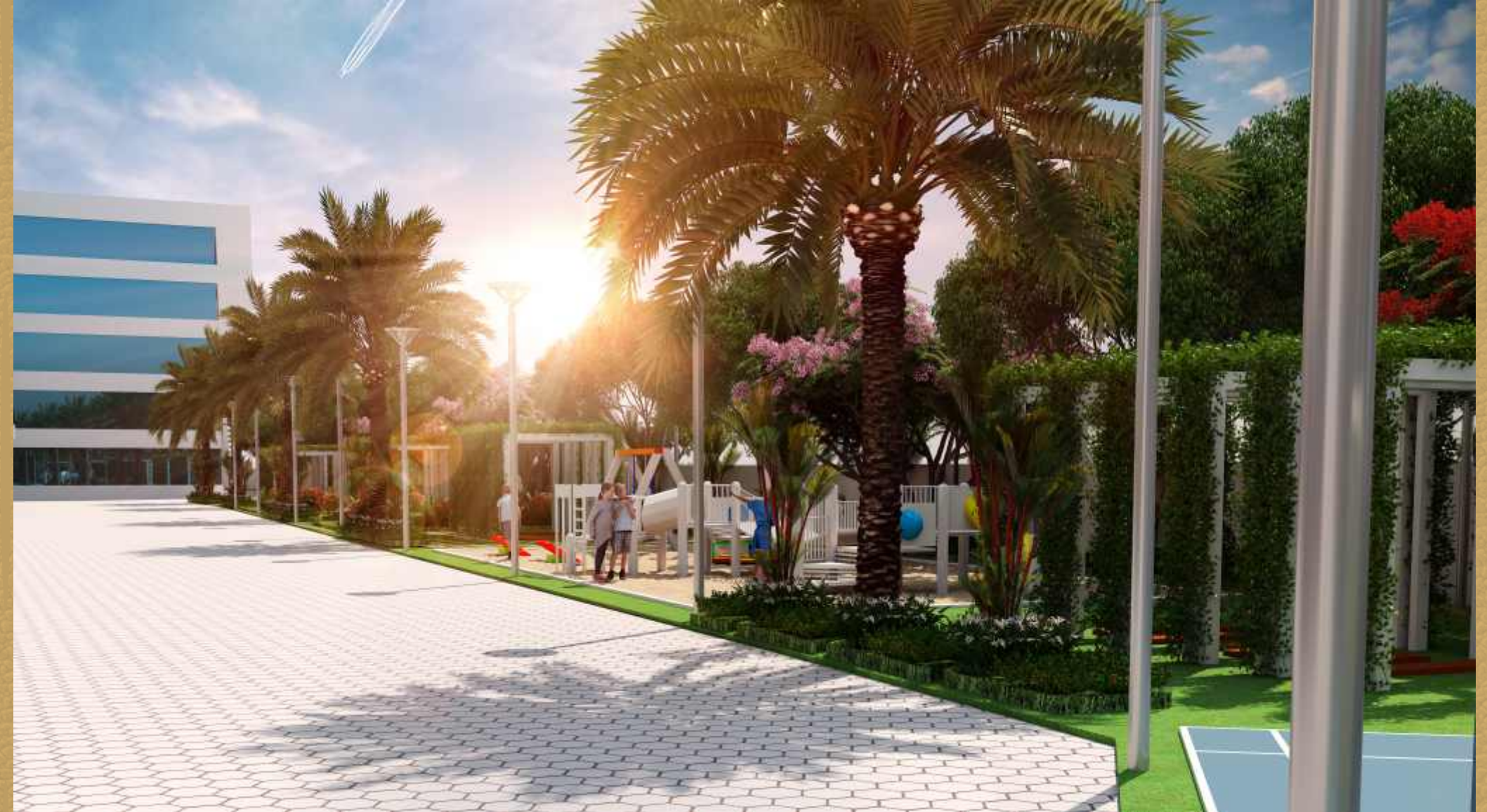
Improve your skills at out door game arena. Enjoy with inmates playing a quick friendly match of Tennis or Basket Ball courts.